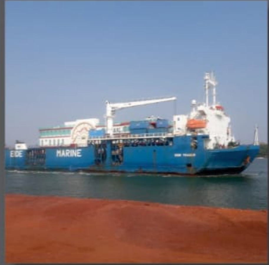
Casino ship dimensions of 70 m x 21 m weighing 2000 mt moved from Mississippi to Goa