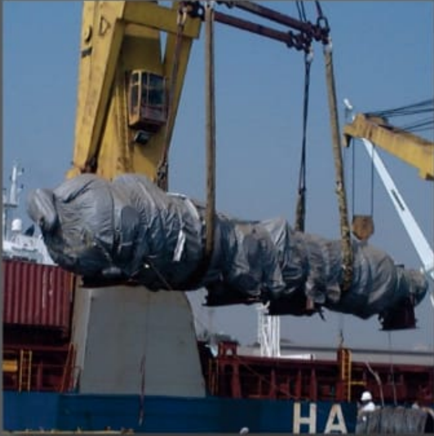
300 mt pieces export from India to Jebel Ali