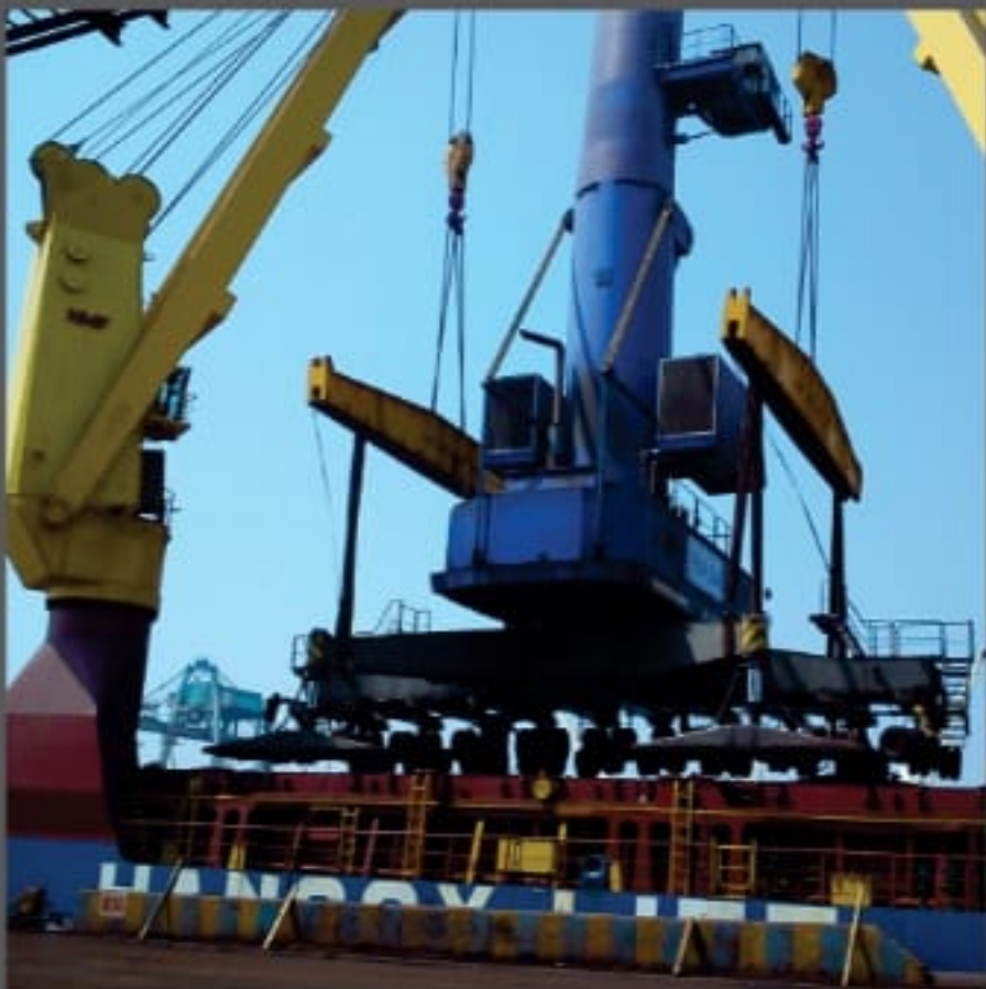
MHC each of 450 mt moved on the coast of India