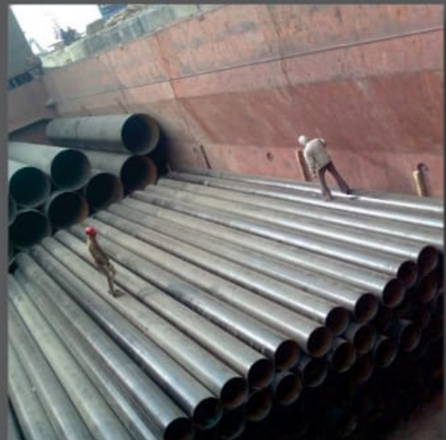
30 inch pipes, 30000 mt cargo export to Damietta